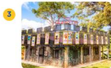
C. beer cans