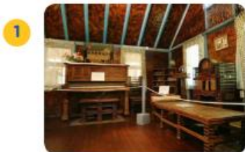
A. plastic bottles

Match the recycled materials they used to make each house 1 .